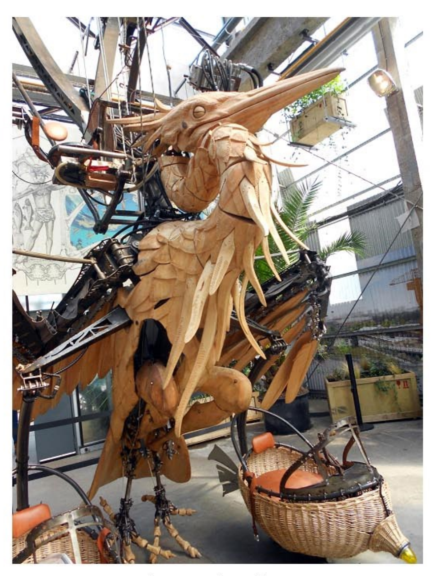
The giant mechanical heron

Once a thriving Atlantic port the city has reinvented itself as a cultural capital with a flavour of craziness and it makes you smile and feel good. It stands on the bank of the river Loire and in the machines de L'ile, a 5 minute majestic stroll aboard a giant 23 metre tall mechanical elephant weighing 50 tons brings you to an equally zany 23 meter tall carousel. They are the brain child of two "mad inventors" Francois Delaroziere and Pierre Orefice and reflect the imaginary world of Jules Verne who was born in the city and the mechanical universe of Leonardo de Vinci.