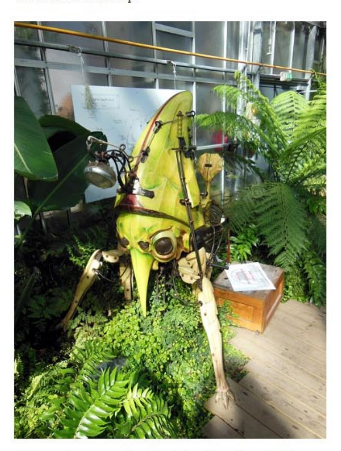
Pulling on levers and handles bring these bugs to life

Actually this is the zany gallery in Nantes machine de L'ile were a group of talented and passionate devotees under the guidance of two mad inventors Francois Delaroziere and Pierre Orefice work on a project that when complete will be mind boggling. They are creating a heron tree made from steel and when finished it will stand over 35 metres tall. Within it will be walkways, platforms and all manner of surprises including many of the mechanical creatures which stare at you from every corner. It will unite the mechanical world with the natural wonders of nature and will be festooned with plants. At the top will be two great platforms from which the mechanical herons will fly. Even now you can walk on one of the prototype branches which soars over the cafe and you can watch the work as it goes ahead in the workshop.