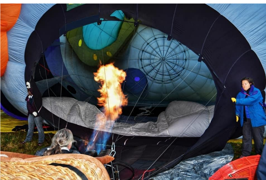
EARLY MORNING ASCENT

'Phew gas was getting low, had me worried for a minute or two ' said our hot air balloon pilot after he had spent considerable time searching for a suitable landing spot away from power lines and livestock. Next came the call to 'brace and prepare for a bumpy landing' but fortunately we landed upright with just a few kangaroo jumps as we touched down. Most balloon rides are uneventful but it made me appreciate the importance of the pilots briefing which I was lucky enough to attend before the mass ascent at Bristol's Balloon Fiesta. It gave a great insight into the skill required by the aviators and the importance of getting precise local weather conditions.