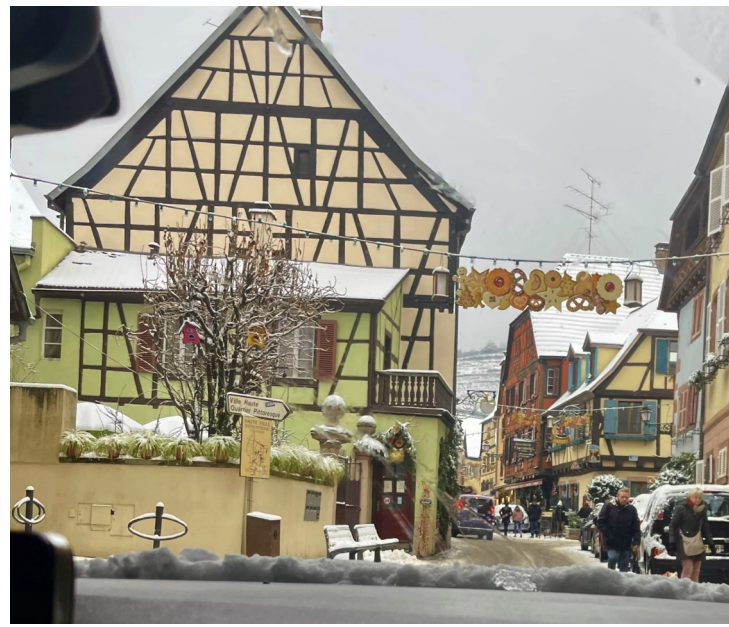
2 VIEWS OF RIBEAUVILLE