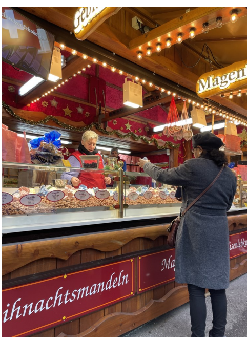
CHRISTMAS MARKETS AT THE CATHEDRAL