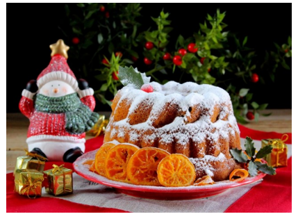
TEDDY DECORATIONS TYPICAL ARCHITECTURE MARKET STALL KUGELHOPF

Words: Janet Myers